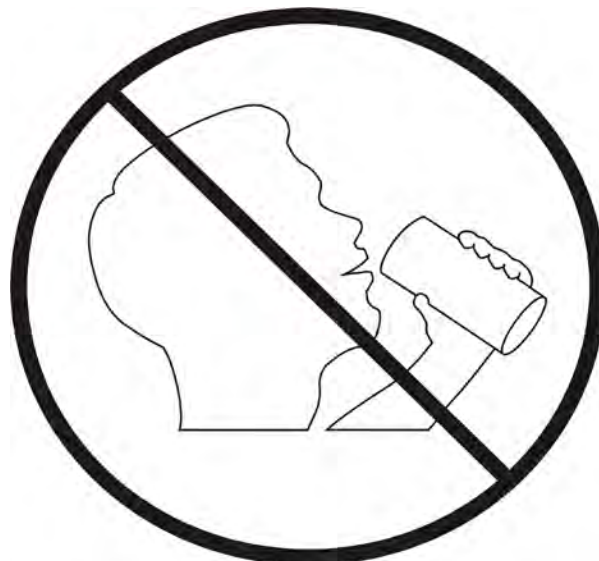
Figure 1301.3 – Pictograph DO NOT DRINK

1301.3 Signage required. All non-potable water outlets such as hose connections, open ended pipes, and faucets shall be identified at the point of use for each outlet with signage that reads as follows: "Non-potable water is utilized for [application name]. Caution: non-potable water. DO NOT DRINK." The words shall be legibly and indelibly printed on a tag or sign constructed of corrosion-resistant waterproof material or shall be indelibly printed on the fixture. The letters of the words shall be not less than 0.5 inches in height and in colors in contrast to the background on which they are applied. In addition to the required wordage, the pictograph shown in Figure 1301.3 shall appear on the signage required by this section.