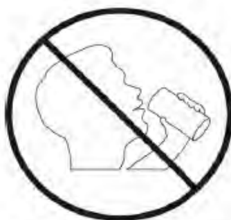
Figure 706.2 Pictograph – DO NOT DRINK